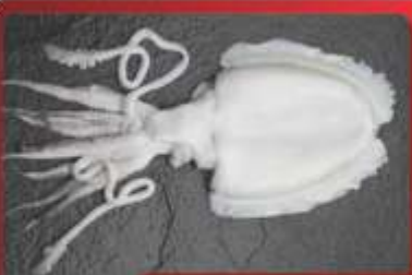
Whole Cuttle Fish